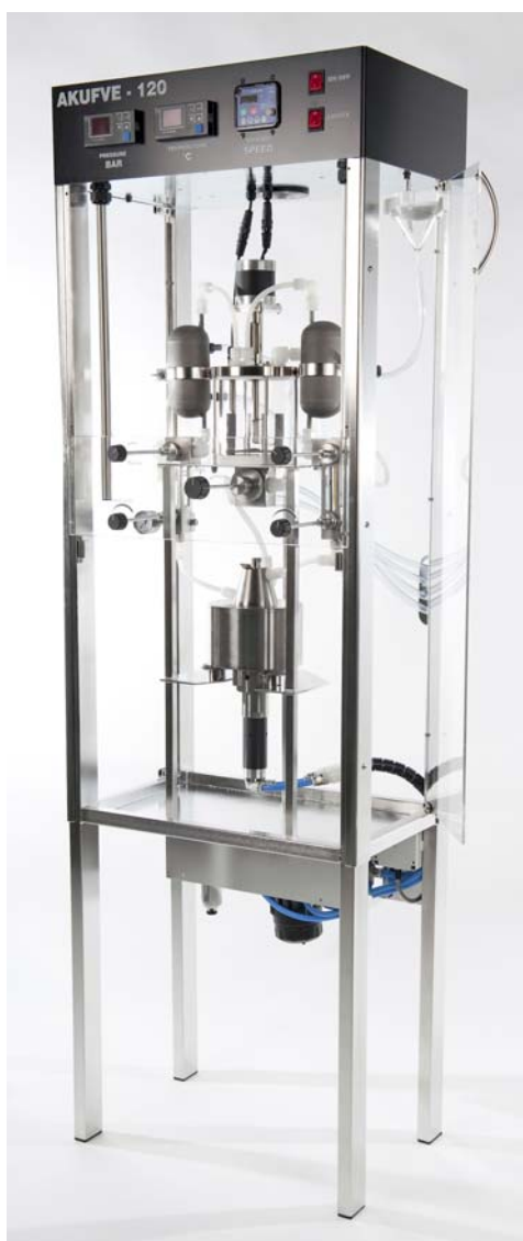
Front view of AKUFVE-120

AKUFVE-120 is characterised as an idealised, one-stage mixer-(centrifugal)-settler unit. It was developed about 40 years ago (some hundred units are on the market) to improve accuracy and rapidity in the measuring technique of solvent extraction distribution data.